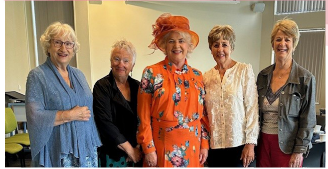
High Tea to thanks North Invercargill Inner Wheel March 2024

Hospice Its Not What You Think? ... Its Better.